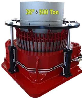
ITEM CODE TI: Pneumatic Hinged Casing Spider 36 " • 500 Ton