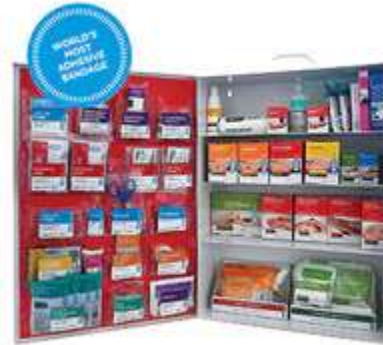
ITEMS: SS 4 SHELF MEDICAL AID