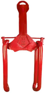
TI CODE: Becket & Tool Pushing Links