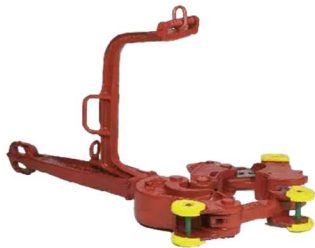
HT Manual Tongs / CODE: TI