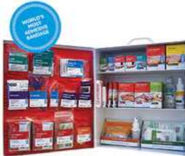
3 SHELF MEDICAL AID