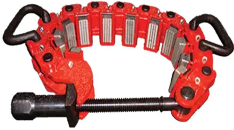
CODE TI: Multi-Purpose (MP) Safety Clamps Adjustable to a variety of tubular Sizes: 2-7/8" to 30-1/2" Options: Air Over Hydraulic