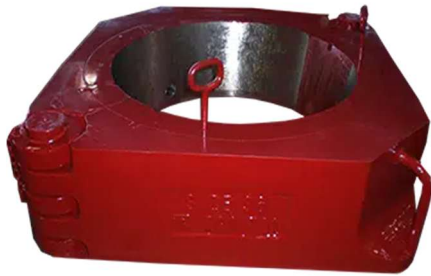
ITEM CODE TI: 36" 500 Ton Hinged Casing Spider