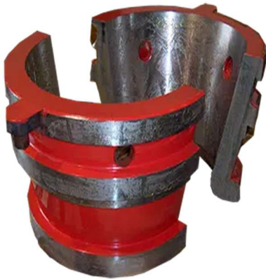
TI CODE: Drill Bowls #1, #2, and #3 designed to fit inside the MPCH and MSPC Master Bushings.