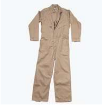
ITEMS: SS OVERALL / COLOR: BROWN – GREY