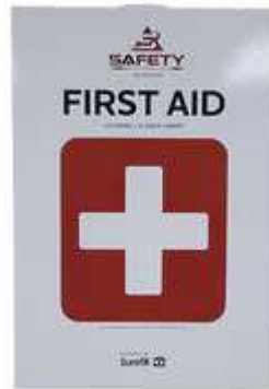
4 SHELF METAL FIRST AID / 3 SHELF ALSO AVAILABLE