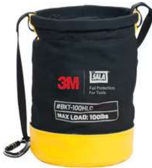
ITEM: SS - TOOL BUCKET