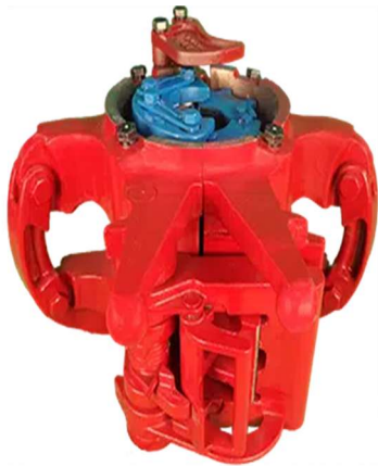
ITEM CODE TI: Y Series Slip Type Elevators MYT • YT • YC • MYC • HYC