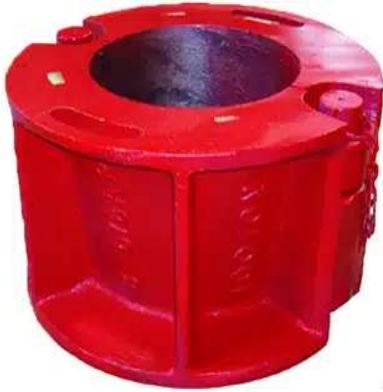
ITEM CODE TI: 10-3/4" 150 Ton Bowl 100 Ton – 8-5/8" API Bowl & 150 Ton – 10-3/4" API Bowl