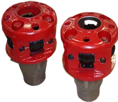
CODE TI: Kelly Drive Bushings HDP, HDS Hex Pin • Square Pin