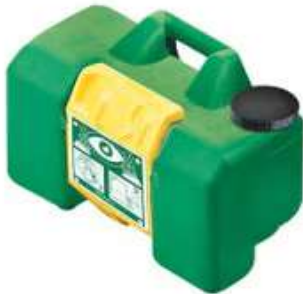
ITEM: SS / EYE WASH SALINE 9 GALLON

designed to cater for all bloodborne related spills in the workplace. A blood borne spill is an unintended release of a potentially infectious material.