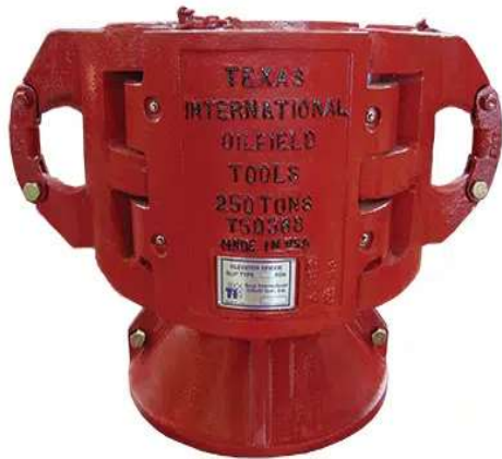
250 / 350 / 750 Ton Elevator Spider / CODE: TI