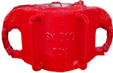
ITEM CODE: TI / SX Side Door Elevator 9-5/8" to 18-5/8" | 350 Ton – 500 Ton