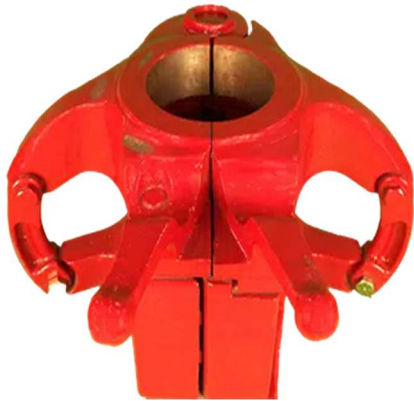
ITEM CODE TI: A Series Center Latch Elevator 2-3/8" to 11-1/4" • 65 Ton to 150 Ton