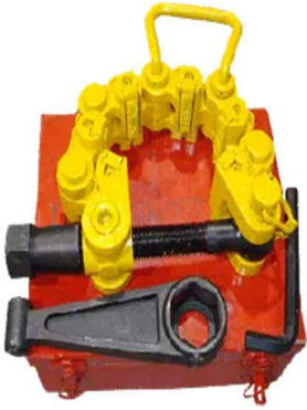
CODE TI: New sizes: 3-3/4" to 47" (OVER 15 SIZES AVAILABLE)