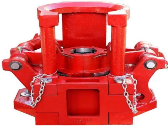
CODE TI: Pneumatic Tubing Spider Type C, CHD, E, F Model CHD: 1.315" – 5-1/2" 125 Ton Model E: 2-3/8" – 7-5/8" 175 Ton Model F: 2-3/8" – 8-5/8" 200 Ton