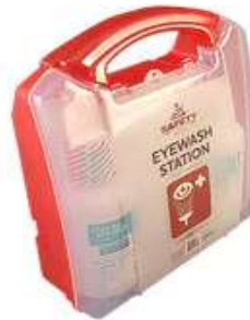
WALL UNIT – EYE SALINE SOLUTION 32 OZ