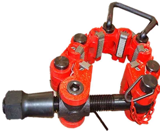
CODE TI: Type "T" Safety Clamps New sizes: 1-1/8" up to 4-1/2" 1-1/8" – 2" 2-1/8" – 3-1/4" 3-1/4" – 4-1/2" Options: Air Over Hydraulic